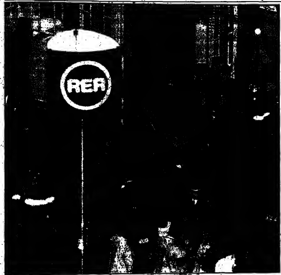
Emergency forces take position outside the Paris subway station where a bomb exploded yesterday, killing two people, and injuring 80. No one has claimed responsibility for the explosion.